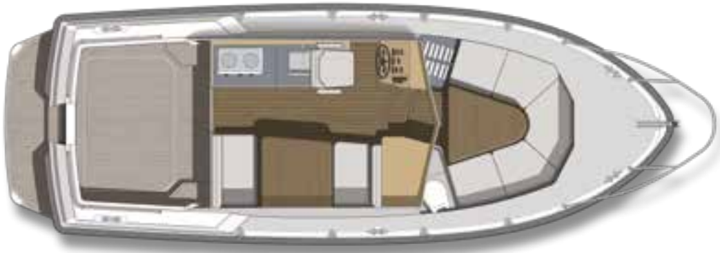
Layout shows Sterndrive version. See page 46 for details of deck plan for Outboard version (also available).