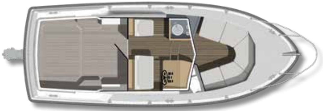
Layout shows Sterndrive version. See page 44 for details of deck plan for Outboard version (also available).

Performance Indicator 220 hp 25 knots 250 hp 27 knots 300 hp (twin) 27 knots